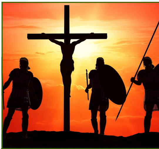
The death of Jesus as fully destroyed their hopes as if He had not forewarned them.

The death of Jesus as fully destroyed their hopes as if He had not forewarned them. The events of probation and trial for the time presented. But more understand-truths than if they veiled. Satan every impression wise unto salvation, and the time of trouble will find them unready. {PrT November 7, 1895, par. 5}