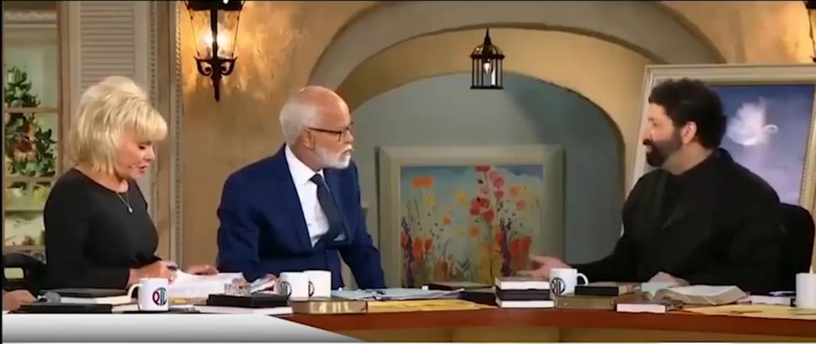
Rabbi Jonathan Cahn