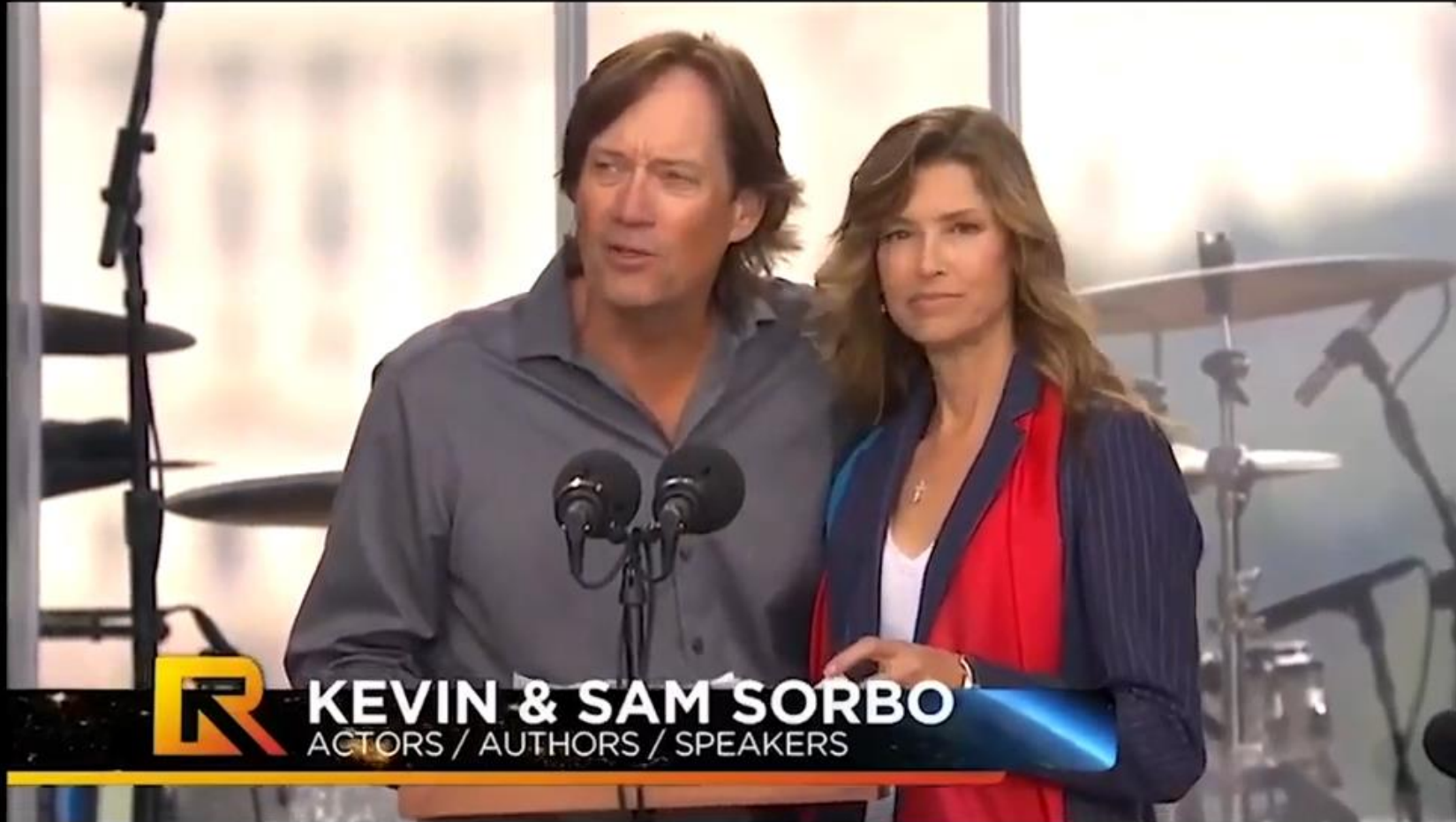
KEVIN & SAM SORBO ACTORS / AUTHORS / SPEAKERS