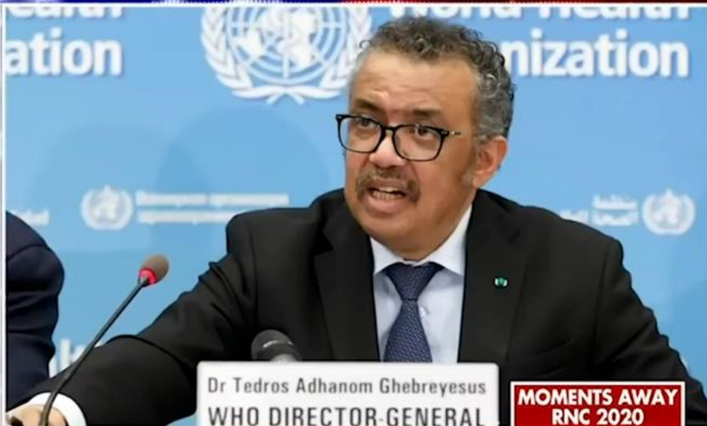
Dr Tedros Adhanom Ghebreyesus WHO DIRECTOR-GENERAL