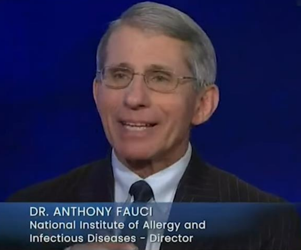
DR. ANTHONY FAUCI National Institute of Allergy and Infectious Diseases - Director