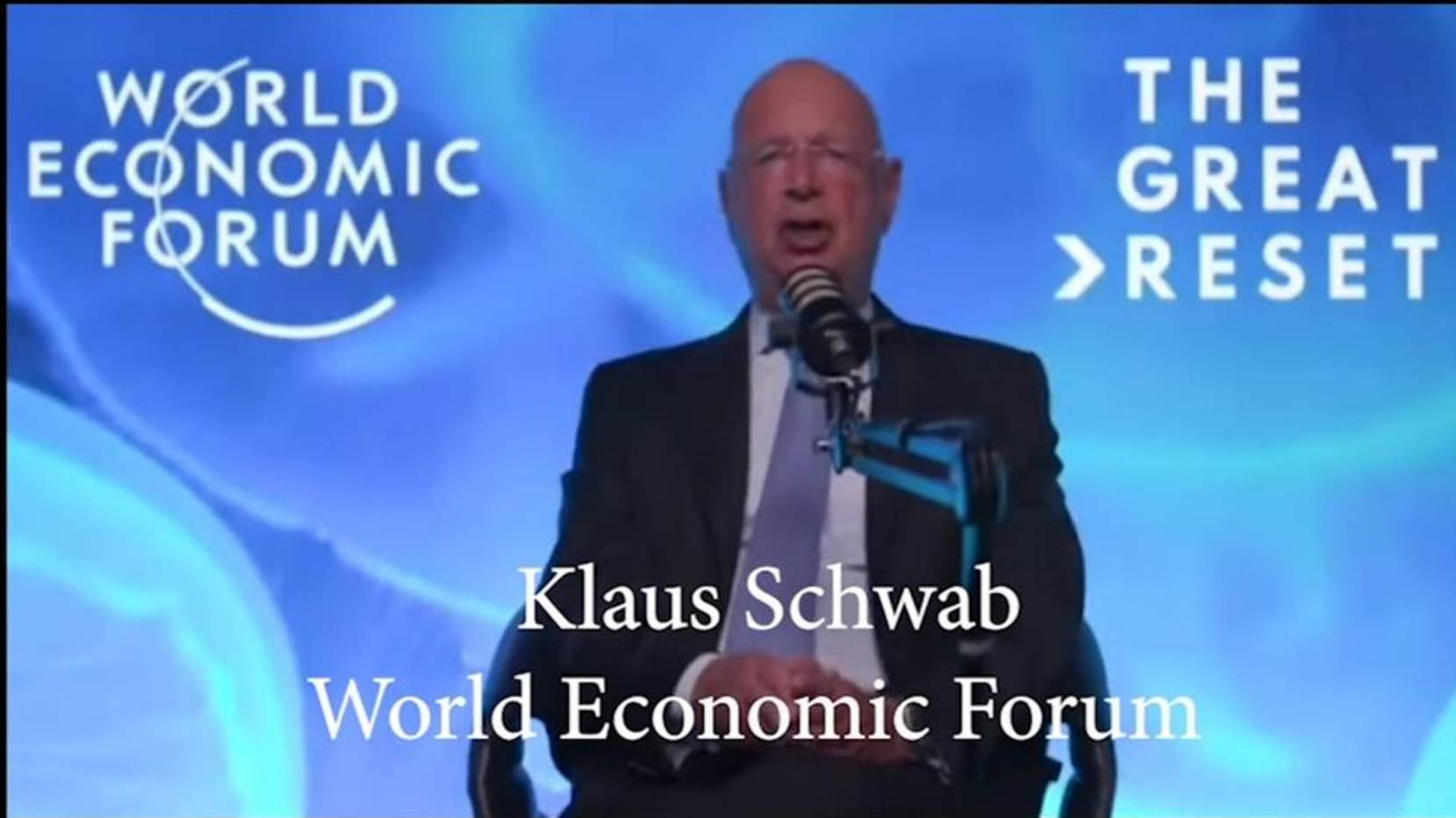
Klaus Schwab World Economic Forum

World Economic forum YouTube Site – The Great Reset