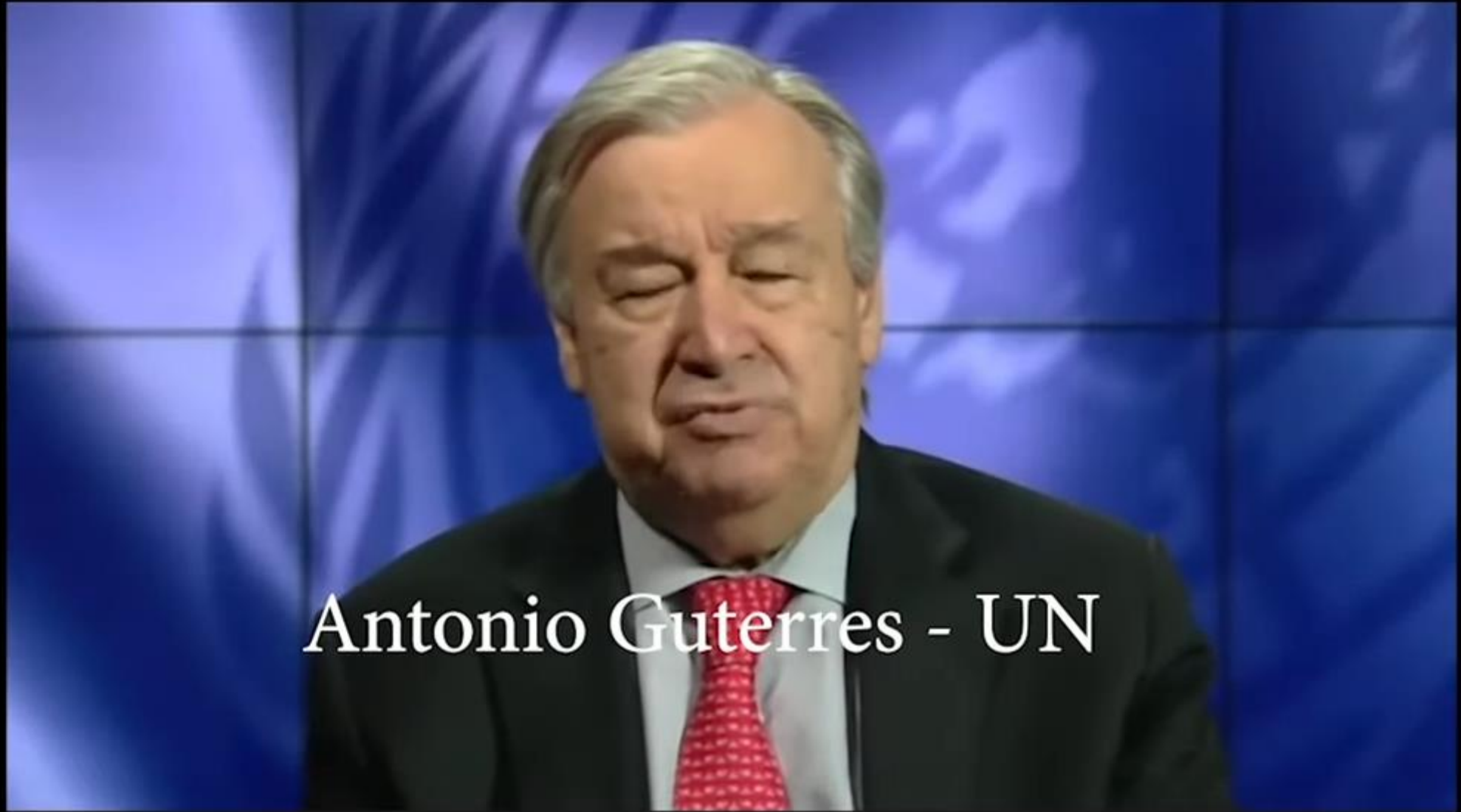
Antonio Guterres - UN

World Economic forum YouTube Site – The Great Reset