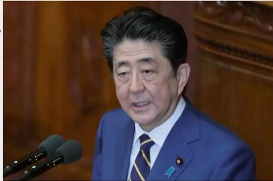
Shinzo Abe delivers a policy speech in Tokyo on Monday, Jan. 20

Japan will 'drastically bolster capability and system in order to secure superiority' in those areas, Abe said. The unit will cooperate with the US Space Command that Trump established in August, as well as Japan's space exploration agency, Japan Aerospace Exploration Agency. Abe has pushed for Japan's Self-Defense Force to expand its international role and capability by bolstering cooperation and weapons compatibility with the US.