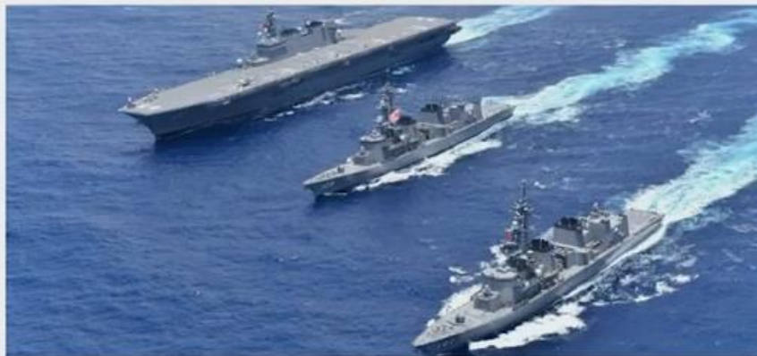
'Izumo' and her escorts.

https://www.forbes.com/sites/davidaxe/2020/06/26/japans-building-aircraft-carriers-chinas-thinking-about-sinking-them/#c3ab31516a05