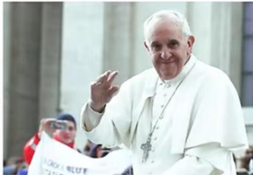
Francis greets the crowd as he arrives to lead general audience at Vatican