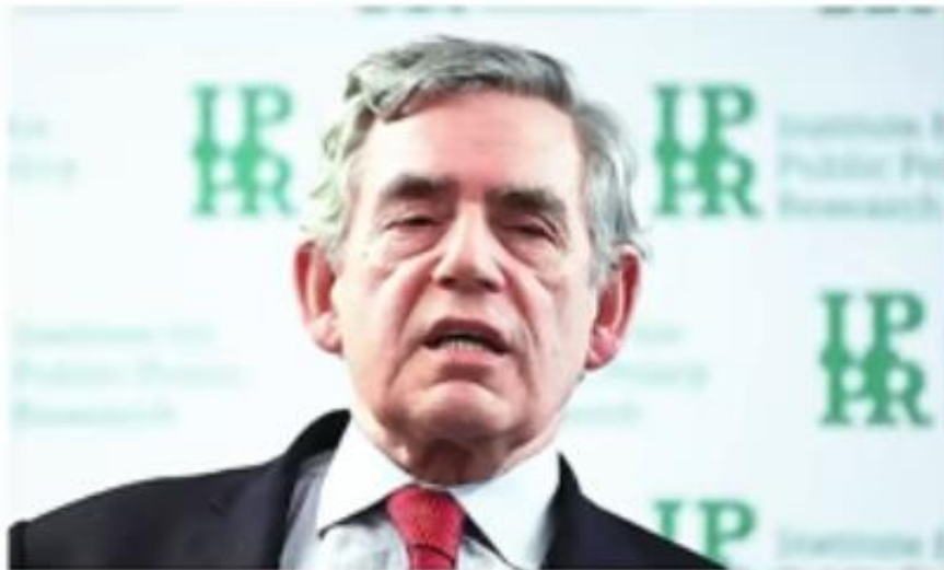
▲ 'The more you intervene to deal with the medical emergency, the more you put economies at risk,' says Gordon Brown.

Gordon Brown has urged world leaders to create a temporary form of global government to tackle the twin medical and economic crises caused by the Covid-19 pandemic.