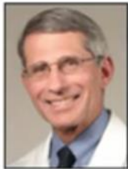
Anthony S. Fauci

Anthony S. Fauci, MD , director of the National Institute of Allergy and Infectious Diseases, said there is “no doubt” Donald J. Trump will be confronted with a surprise infectious disease outbreak during his presidency. Fauci has led the NIAID for more than 3 decades, advising the past five United States presidents on global health threats from the early days of the AIDS epidemic in the 1980s through to the current Zika virus outbreak.