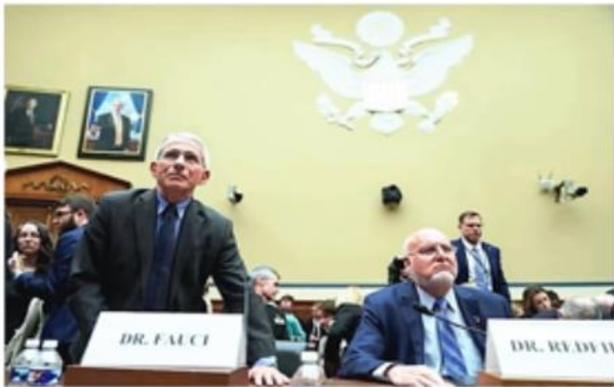
Dr. Anthony Fauci, director of the National Institute of Allergy and Infectious Diseases at the National Institutes of Health, and Dr. Robert Redfield, director of the Centers for Disease Control and Prevention, are seen March 11, 2020.

Home News Faith & Family Viewpoints Regional Life Special Sections Photo & Video