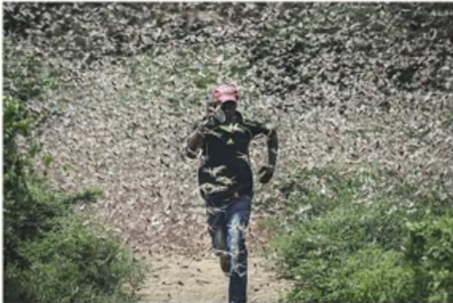
A man runs through a swarm of desert locusts in Kenya.

https://www.scmp.com/news/world/africa/article/3047674/skies-go-black-africas-worst-locust-swarm-attack-decades