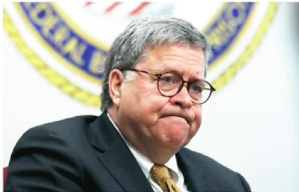
Attorney General William Barr speaks during a tour of a federal prison in Edgefield, S.C. on July 8, 2019. The Justice Department says it will carry out executions of federal death row inmates for the first time since 2005. The announcement Thursday says five inmates will be executed starting in December.