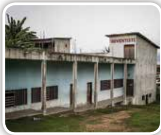
Au College Adventiste (Adventist secondary school) Libreville, Gabon.