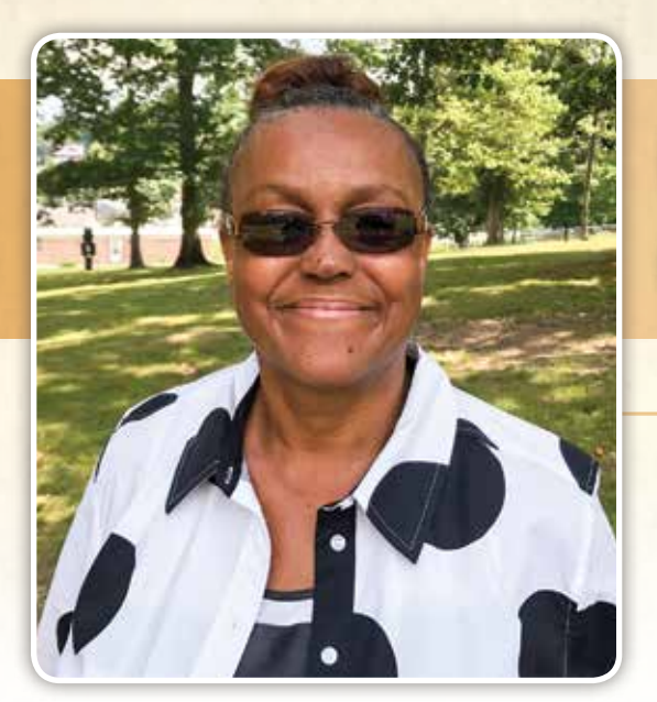
Ask a woman to read this firstperson account.

When I was a little girl, my Seventh-day Adventist grandmother made me go to church for Bible study every Wednesday night in Beckley, West Virginia. On Sabbath mornings, I had to walk eight long blocks to the church. I had to go. I couldn't do anything but go to church and come back home.